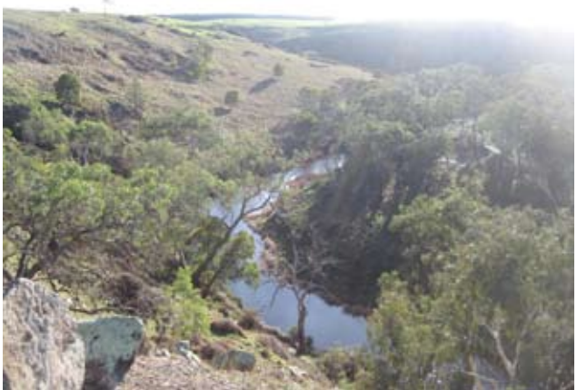
The Leigh Zone's Key assetthe Gorge section of the Leigh River

LCG held a community consultation meeting in April 2011 to invite our members to comment on the proposed reccomendations. As an aid to the meeting, eight large laminated maps which showed data used in the process were commissioned. It was generally noted that that not all data had been sucessfully captured into the databases that supplied the maps and that there could be room for further improvemnet in the process. The event did allow some recognition amongst those there of the different values that could be allocated to local assets and threats.